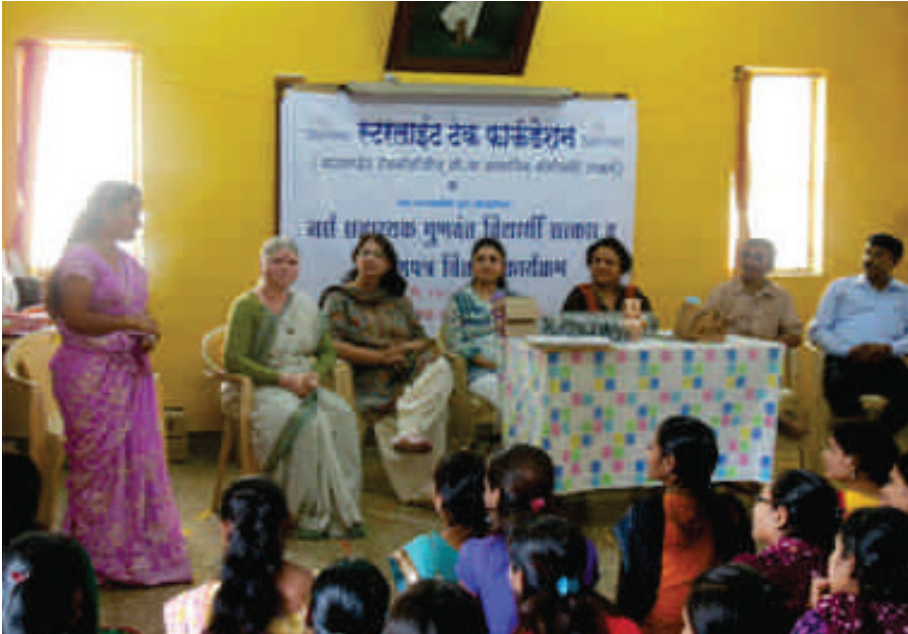
Vocational training programme