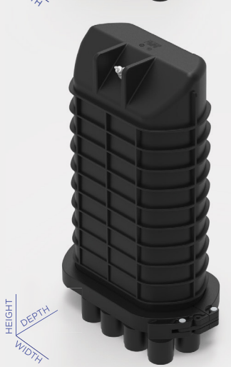
DIMENSIONS HEIGHT 450 mm WIDTH 280 mm DEPTH 150 mm