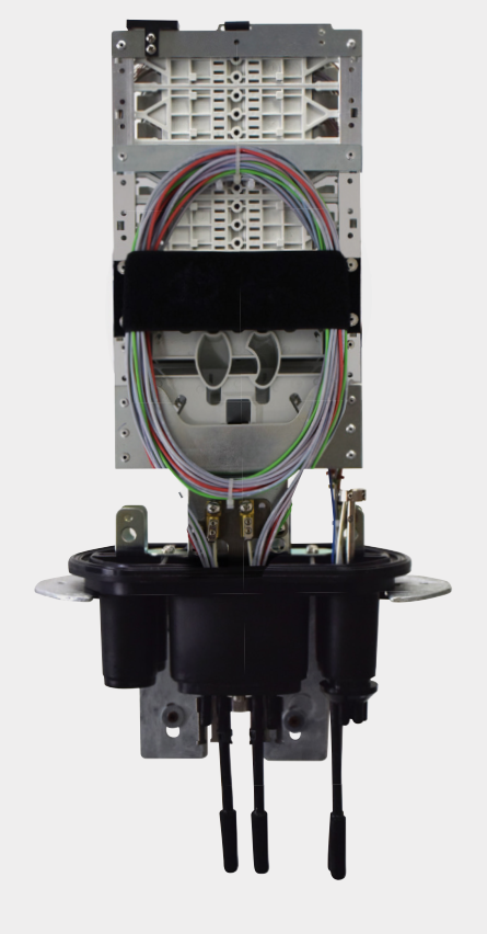
MIDSPAN MODULE STORAGE AREA DETAIL