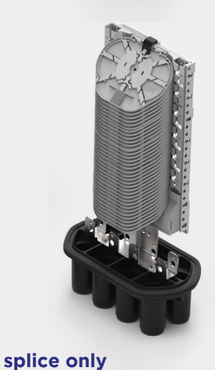
CODC2 AB UP TO 432 FIBRES SPLICE CAPACITY 6 SAMX HD MODULES